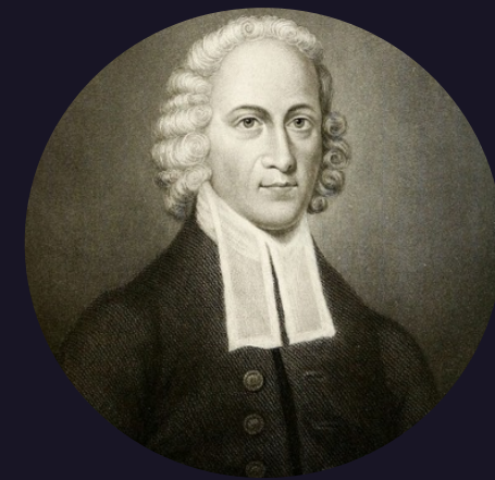
Jonathan Edwards Puritan Theologian

“Our bad things turn out for good, our good things can never be lost, and the best things are yet to come.”