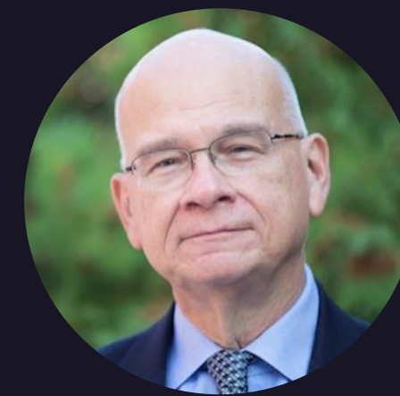
Tim Keller Pastor

“God is so committed to your ultimate joy that he was willing to plunge into the greatest depths of suffering himself for you.”